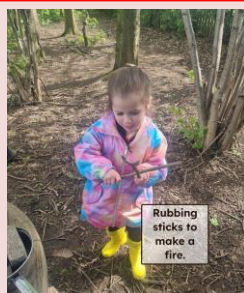
Rubbing sticks to make a fire.

Please make sure your child has a coat for our break times, as the weather changes quickly.